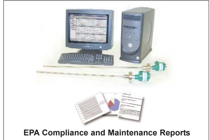
EPA Compliance and Maintenance Reports

Why not adapt and expand existing in-plant process control systems to do the job?